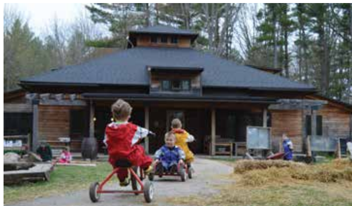
Nature Preschool LEED Gold Certified building