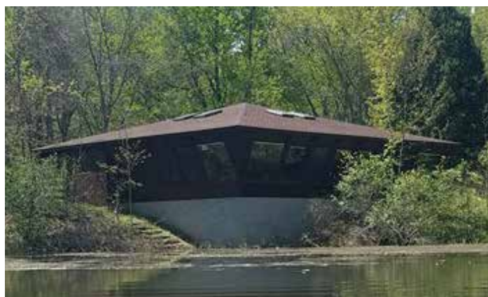
Nature Study Building (NSB)